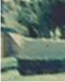
Now You See It.