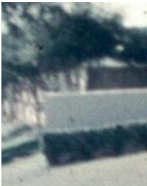
Now You Don't.

In passing, and since the subject came up -- The above are details from Philip Willis' Dealey Plaza photographs 5 and 6 . The first shows what has been labeled as the "black dog." What, if anything, is to be made of the strange object or figure, I don't know and could only guess. But that it does curiously depict something (aside from a photographically created aberration) seems to be plausibly evident.