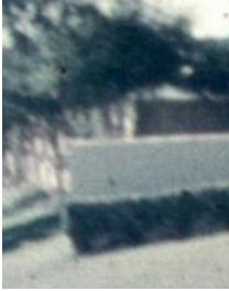
Now You Don't.

In passing, and since the subject came up -- The above are details from Philip Willis' Dealey Plaza photographs 5 and 6 . The first shows what has been labeled as the "black dog." What, if anything, is to be made of the strange object or figure, I don't know and could only guess. But that it does curiously depict something (aside from a photographically created aberration) seems to be plausibly evident.